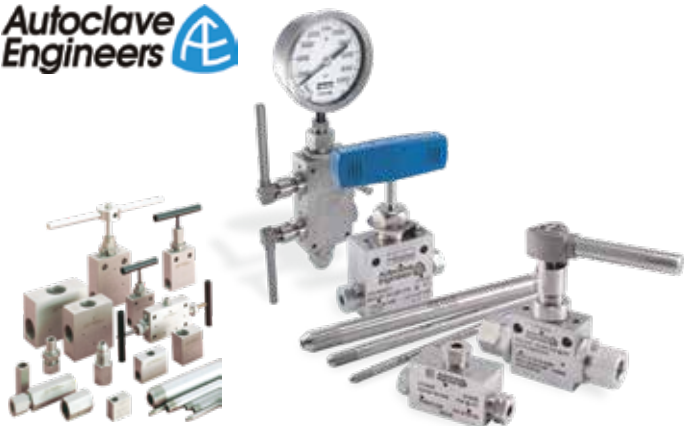
Ultra High Pressure Fittings & Valves to 150,000 PSI