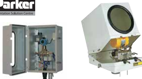
Sun Shades & Enclosures