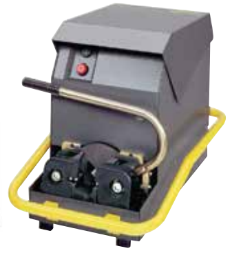
Parflange Flaring & Flanging System