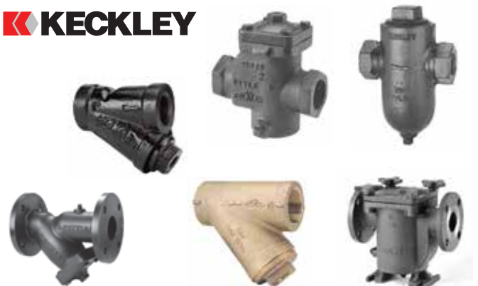
Pipeline Valves & Strainers