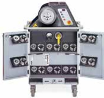
E02 Form WorkCentre