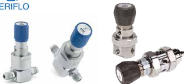
Gas Valves, Precision Diaphragm, Regulators & Flow Control Components