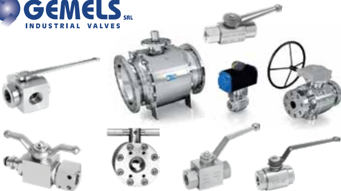
Flow Control Valves