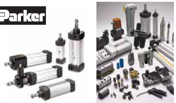
Switches, Directional Valves, Cylinders