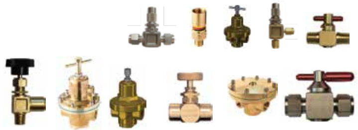
Pressure & Flow Control Devices for Liquids & Gases