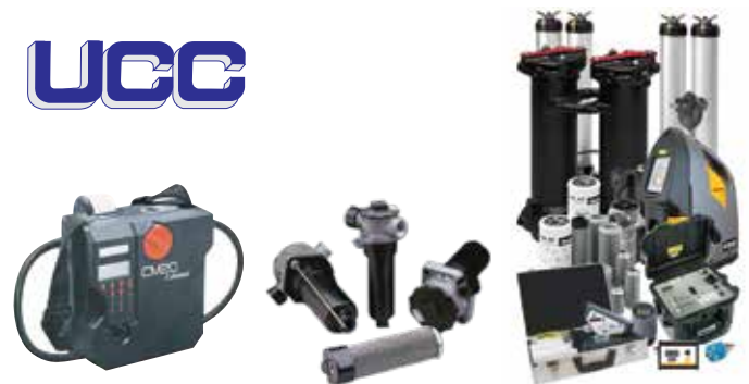
Fluid Conditioning Monitor