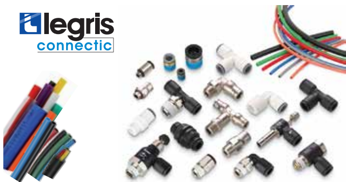
Pneumatic Fittings & Tubing's