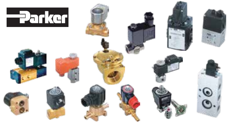
Solenoid Valves (Lucifer, SCEM & Skinner)

"Apollo" Valves manufactured in the USA by CO-EMBED Industries