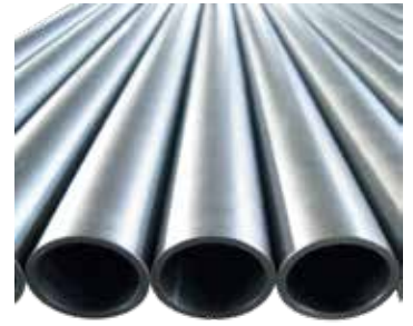
Carbon Steel Hydraulic Tubes