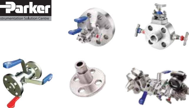
Double Block & Bleed Valves