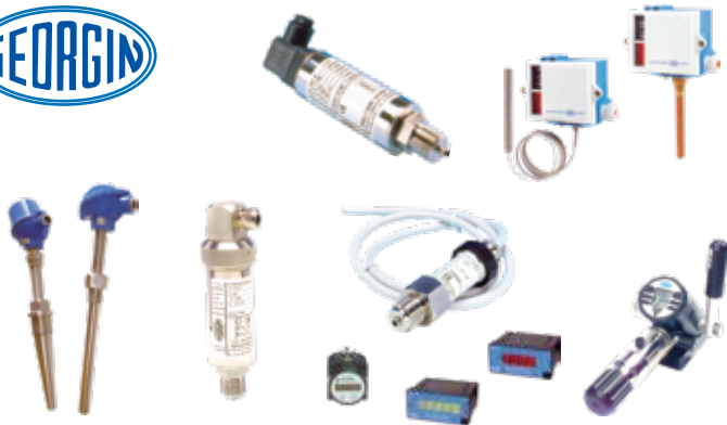
Pressure & Temperature Switches & Transmitters