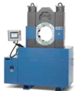
Crimping Machines & Test Benches