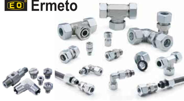
Metric Bite Type Fittings