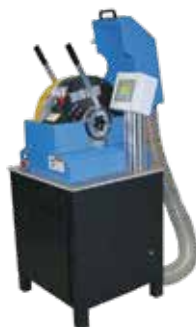
Tube Fabricating Equipments