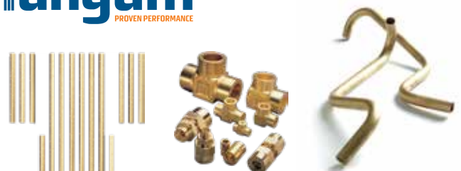
Crevice & Pitting Corrosion Resistant Tubing