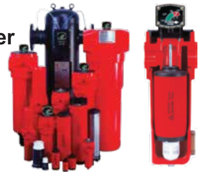
Purification & Separation