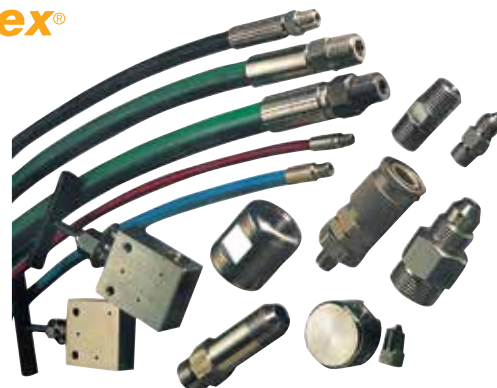
Ultra High Pressure Hoses & Fittings