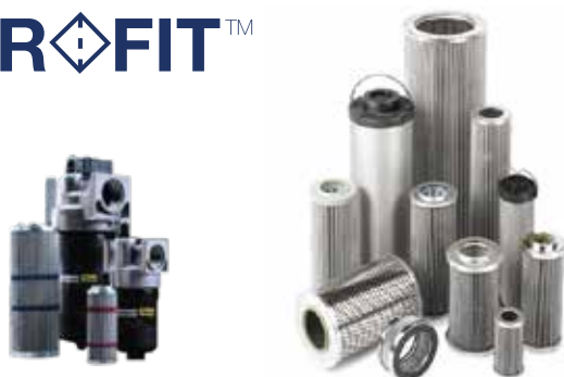
Hydraulic Filters & Elements