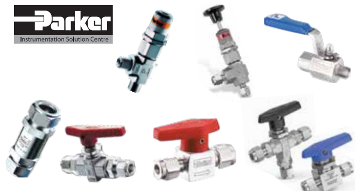
Ball, Needle, Check & Relief Valves