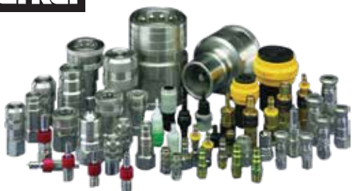
Quick Release Couplings