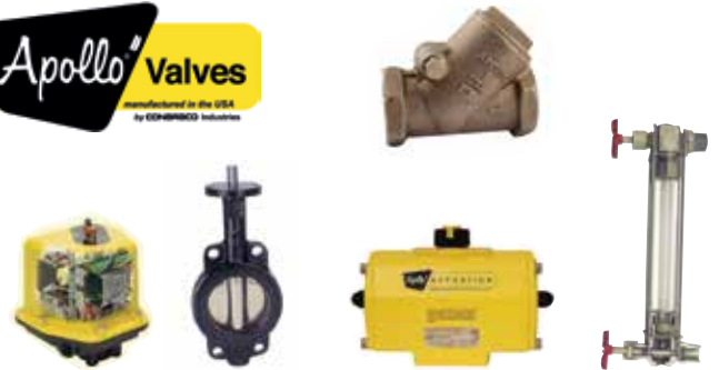
Valves & Actuators

"Apollo" Valves manufactured in the USA by CO-EMBED Industries