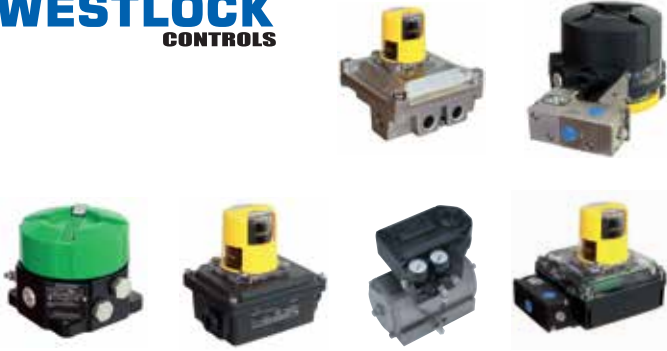
Limit Switches & Positioners