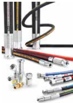
Hydraulic Hoses & Fittings