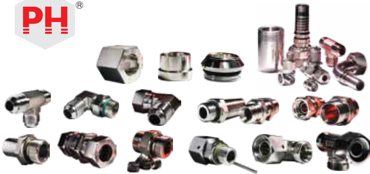
S.S. Hydraulic Fittings & Pipe Connectors