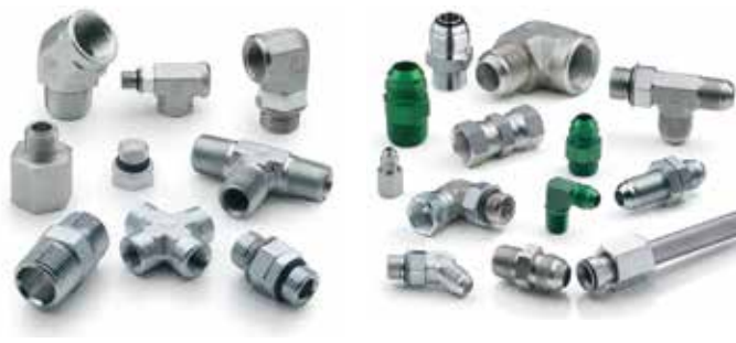
37 Deg Flare, JIC Fittings, Swivel & Flange Adaptors