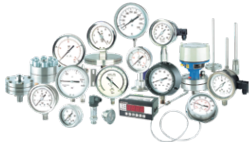
Pressure & Temperature Instruments