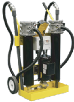
Portable Filtration Trolleys