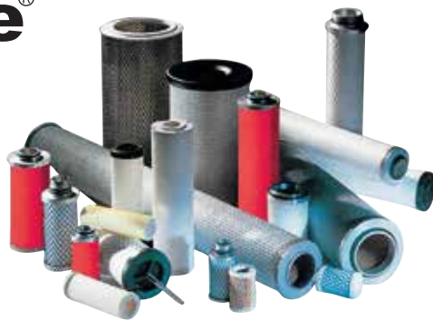
Compressed Air & Gas Filters