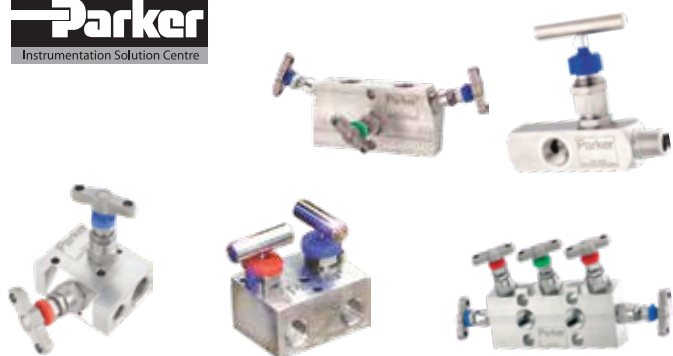
2, 3 & 5 Valves Manifolds