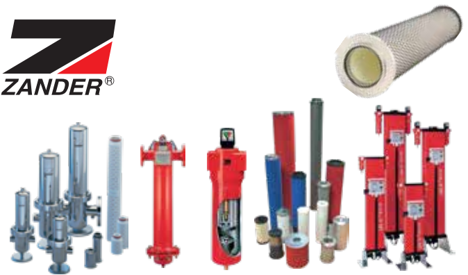
Compressed Air & Gas Filters