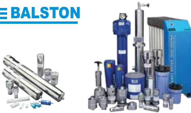
Air / Gas Filter