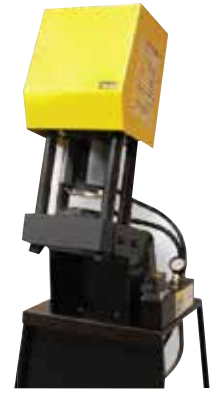
Parkrimp Hose Crimpers