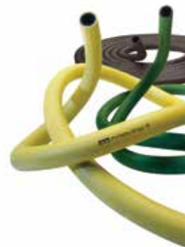
Industrial Hoses (Air / Water & Oil / Fuel)