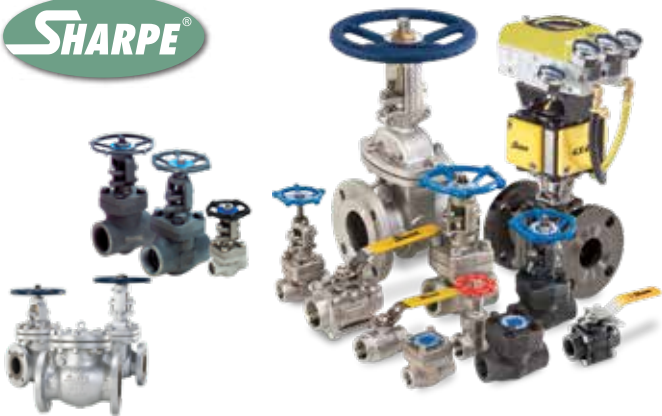
Valves, Automation & Controls