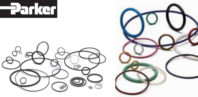
O-rings & Seals