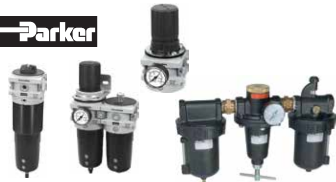
Filters, Regulators & Lubricators