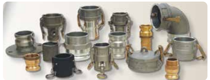
Cam & Groove Couplings