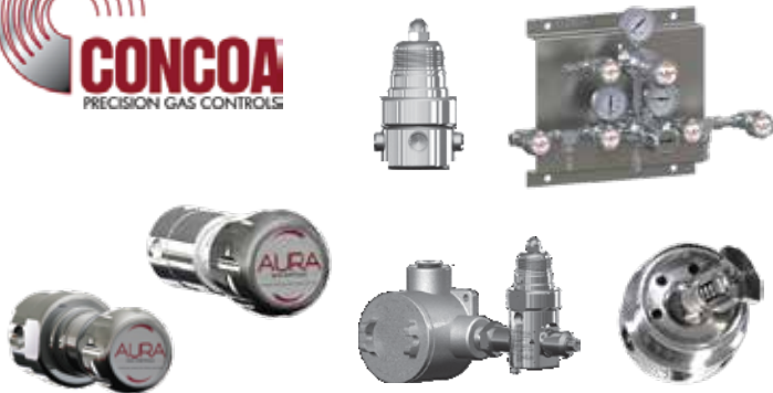
High Pressure Gas Regulators