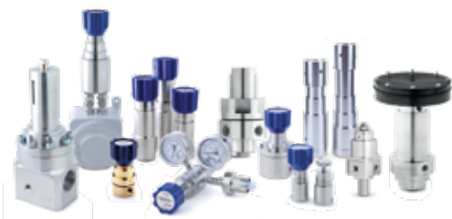
Total Pressure Regulator Solutions