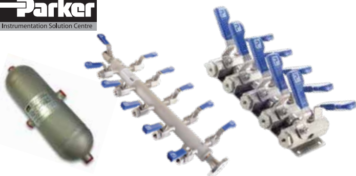
Distribution Manifolds & Sample Cylinders