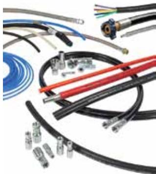
Thermoplastic Hoses & Fittings