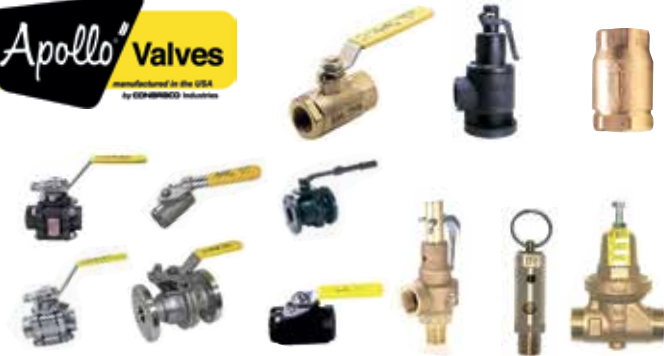
Valves & Actuators

"Apollo" Valves manufactured in the USA by CO-EMBED Industries