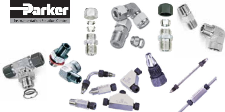
A-LOK, CPI, MPI & Pipe Fittings