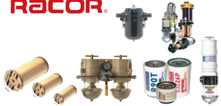
Fuel Filter & Water Separators