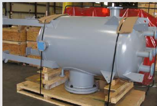
Tanks & Vessels