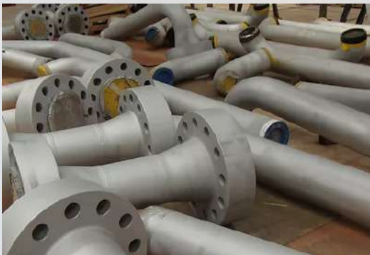
Pipe Spool Fabrication

Our fabrication yard located in ICAD III has been custom-built for the construction, assembly and load-out of onshore structures.