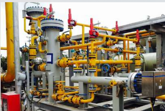
Process Skids / Modules